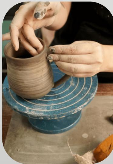
Carefully Crafted Messaging