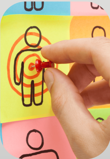
Targeted Prospect Outreach

Social selling keeps you present during the critical first half of their buying journey.